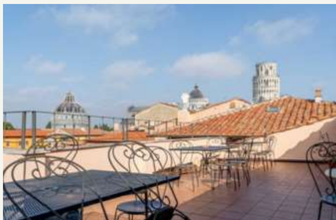
Rooftop terrace, Third Floor Polo A